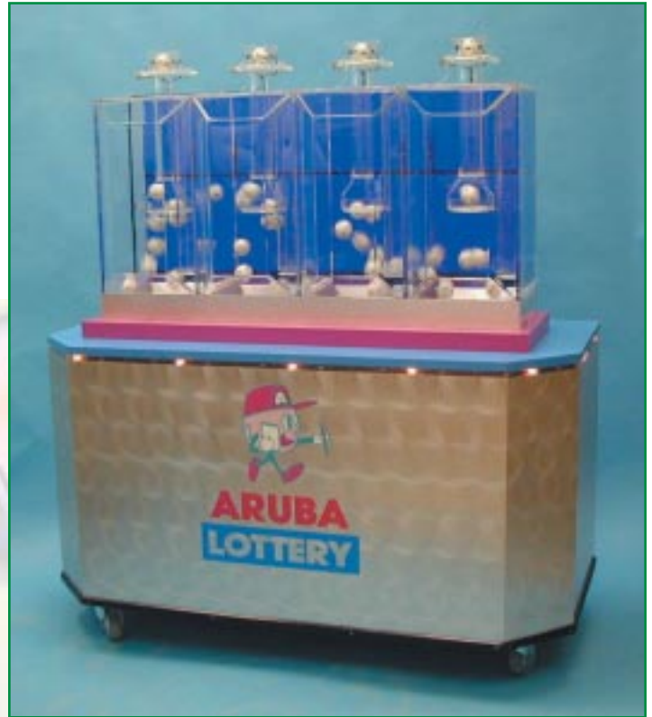
This brilliant MultiDigit Gem was recently supplied to Fundación Lotto pa Deporte, Aruba.

Smartplay International One Linda Lane Southampton, NJ 08088 USA