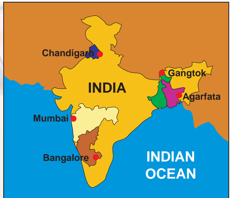
Smartplay has equipment placed in five Indian cities: Chandigarh, Mumbai, Bangalore, Agartala, and Gangtok.

This compares to the 1% revenue which states receive from the sale of paper lottery tickets. The