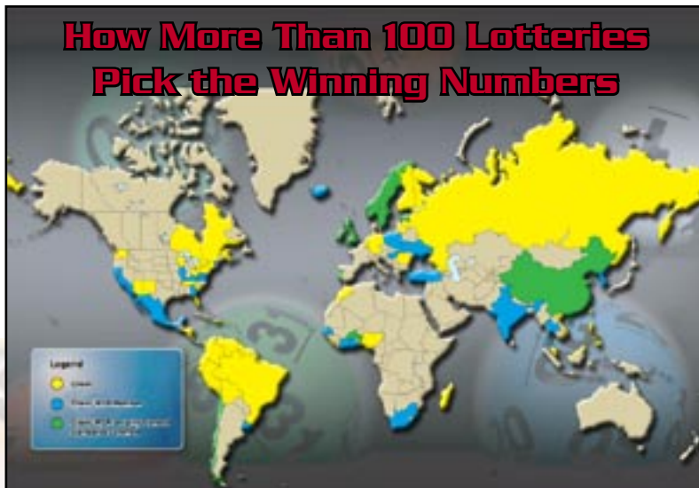
Smartplay serves over one hundred clients worldwide, including several WLA members. Visit our web site: www.smartplay.com for a more detailed map and client information.

In the USA, WLA member New Jersey Lottery recently contracted with Smartplay for the provision of a custom Saturn machine to update the Jersey Cash 5 game. The air mix machine features a base cabinet, designed to complement the game logo.