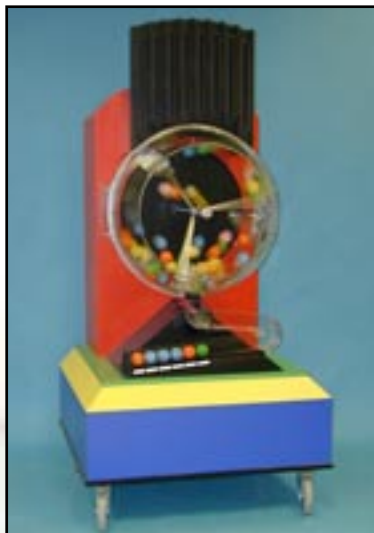
Uthingo's Criterion II in its bold South African colors.

Lottery of South Africa followed suit. Having launched the National Lottery with a Beitel Criterion in '99. They have since upgraded to Smartplay's Criterion II.